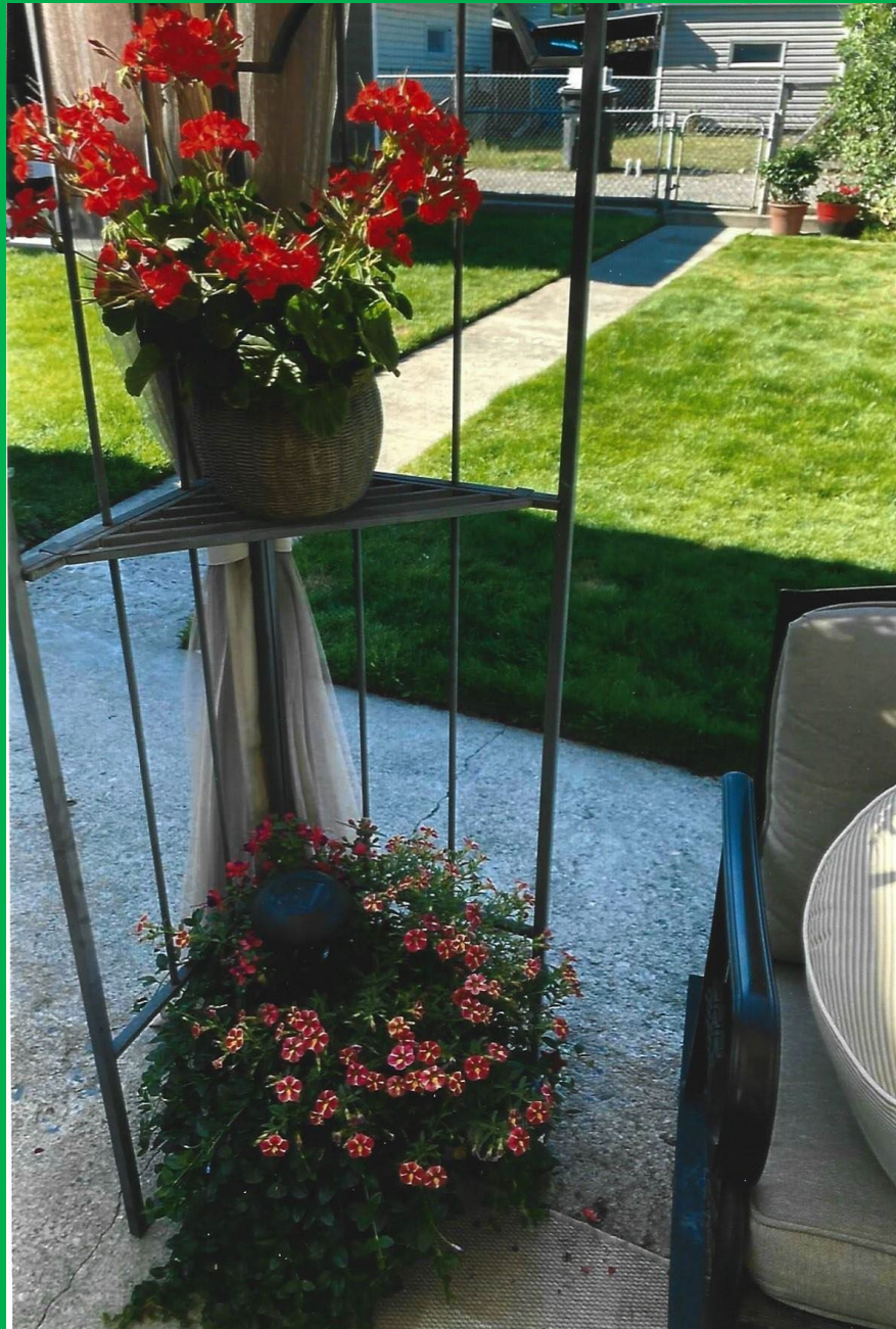
Miranda Rozan – Flower Container