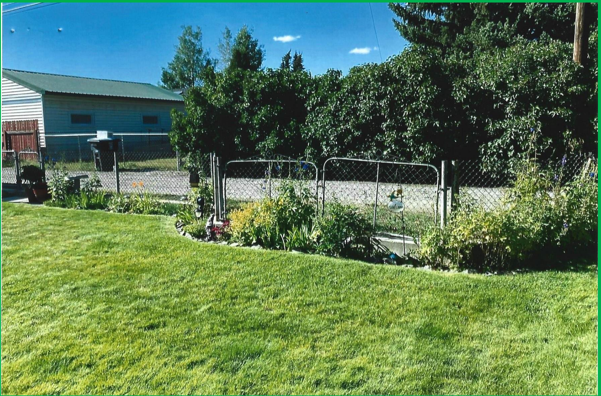
Miranda Rozan - Landscape