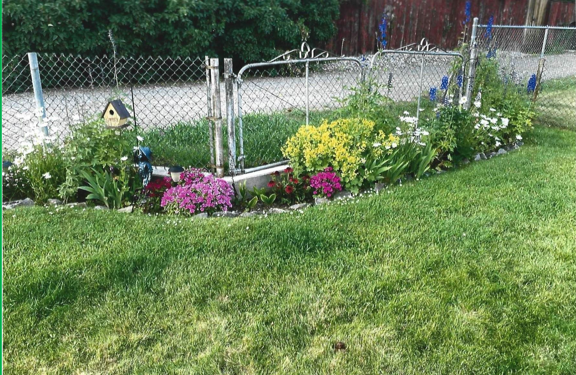
Miranda Rozan – Flower Bed