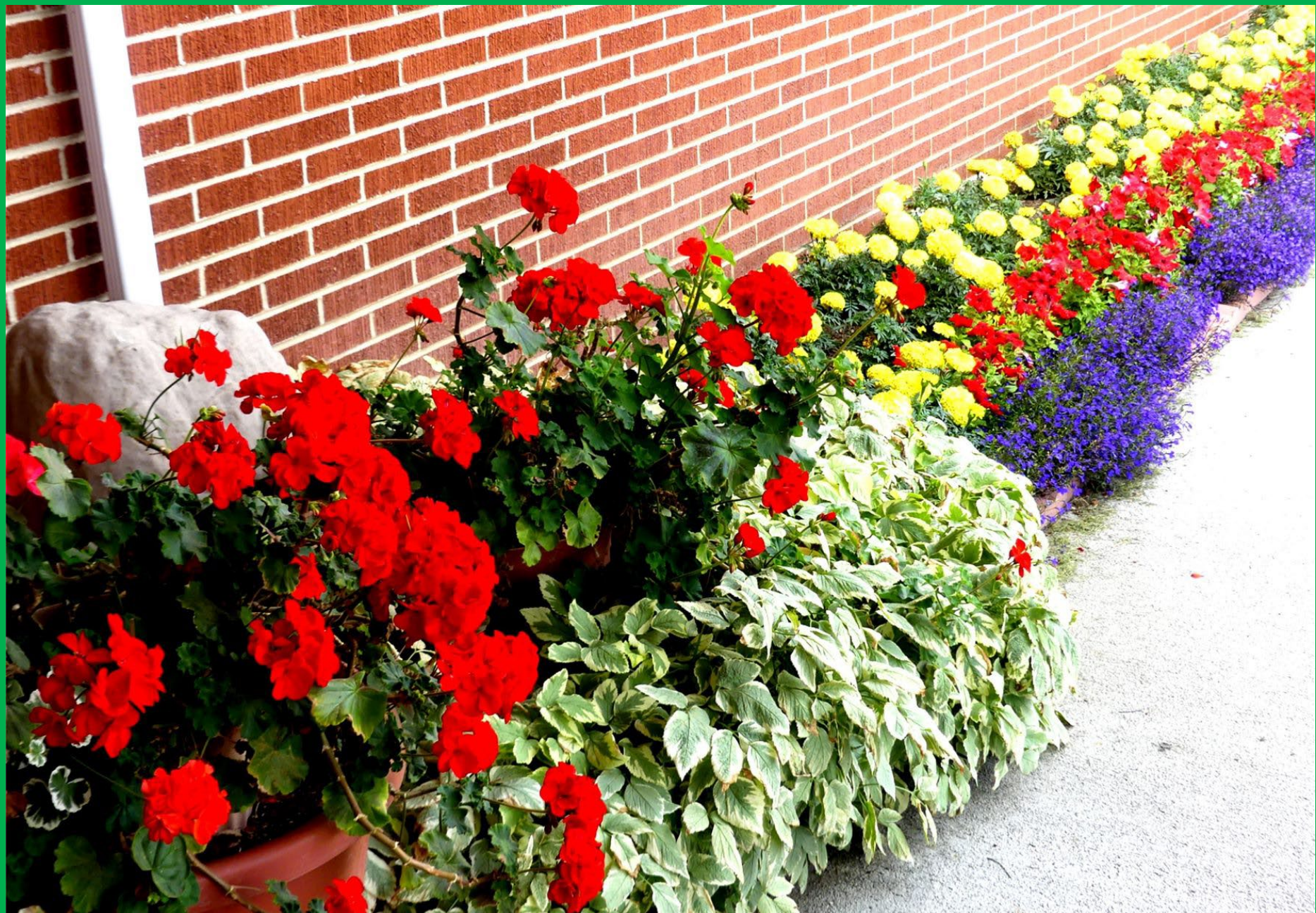
George Parret - Garden of the Week