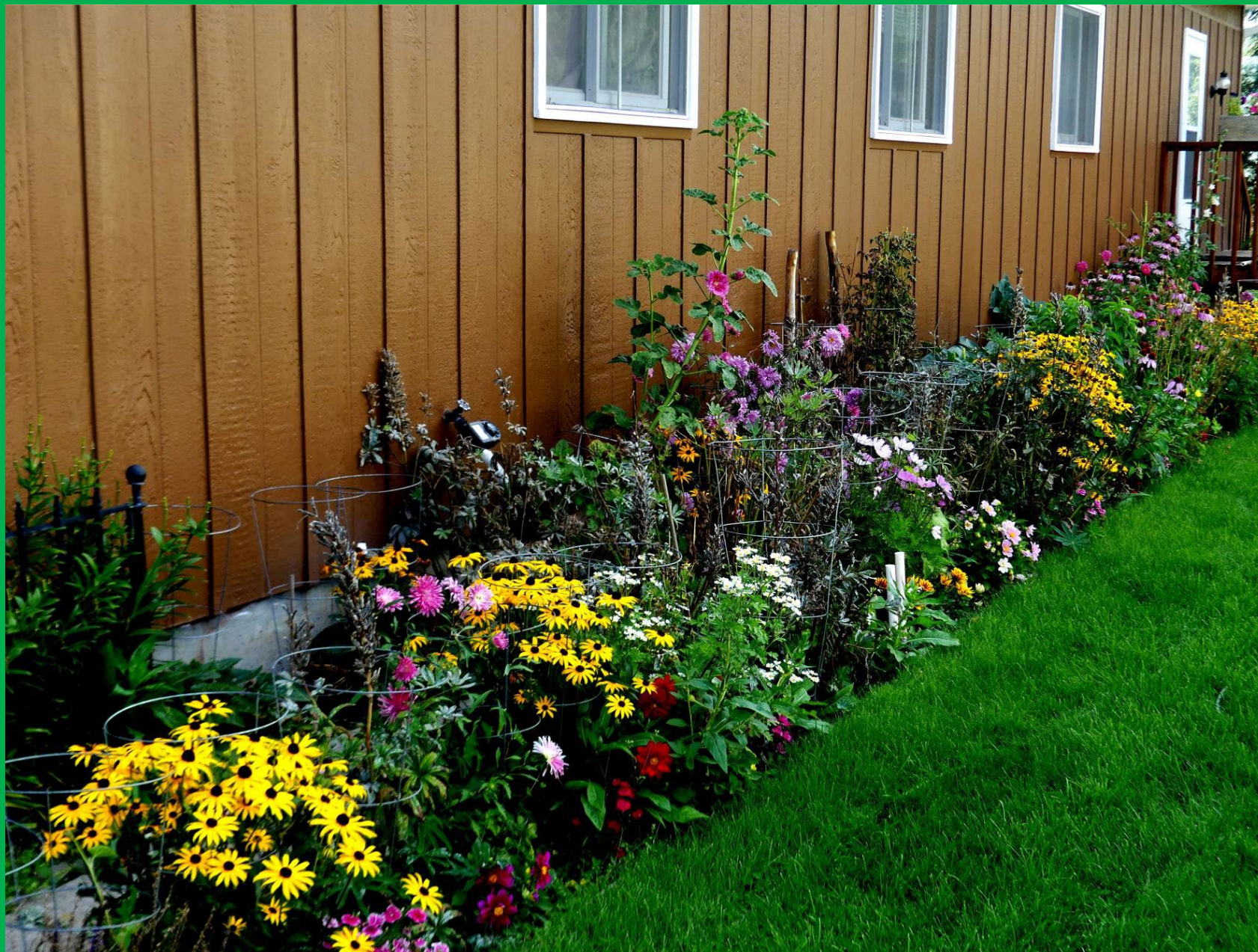
Joe Stolarz - Garden of the Week