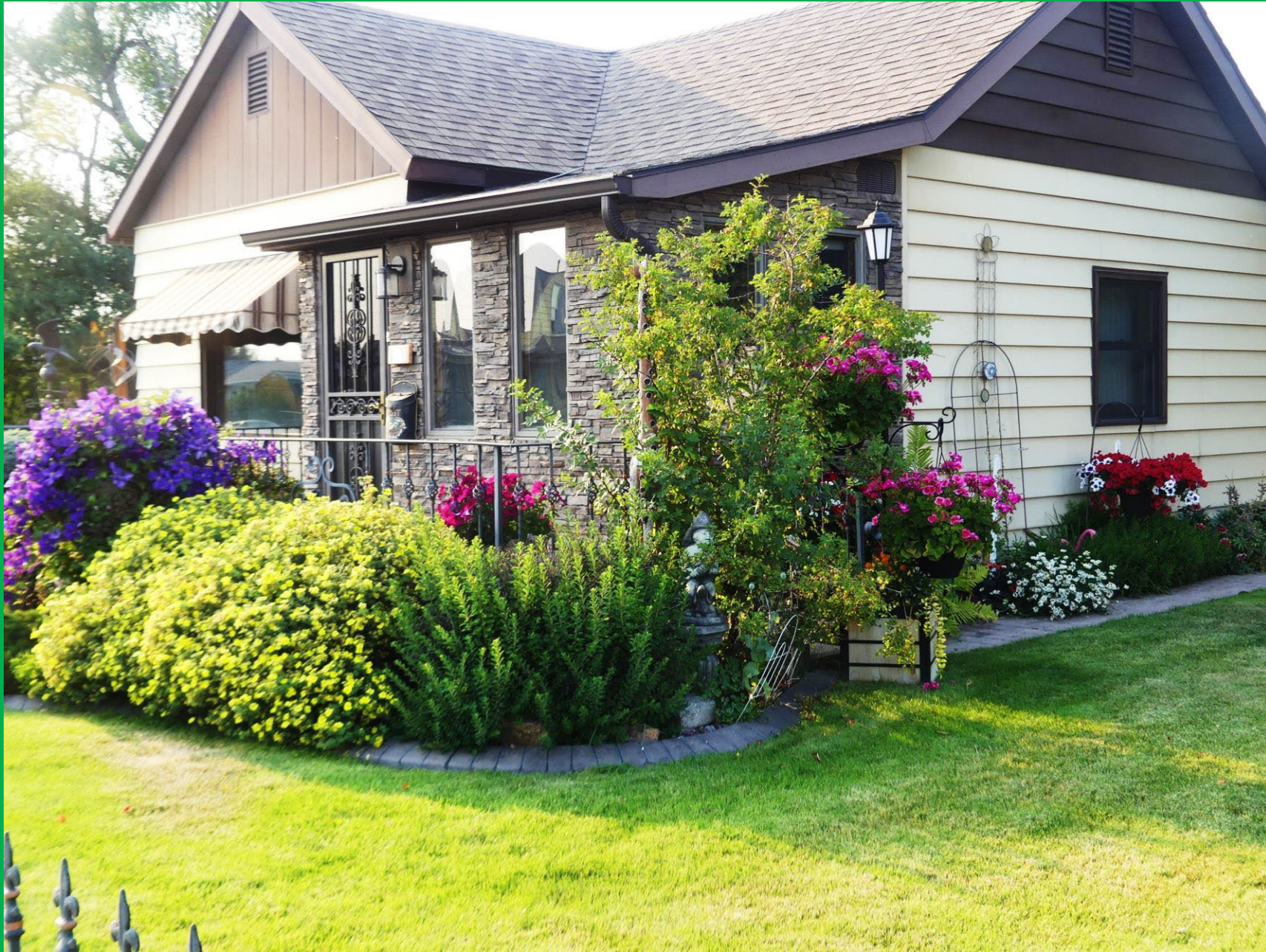
Sharon & Dave Crase - Garden of the Week