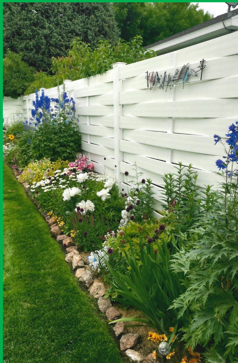
Dee Rozan – Flower Bed