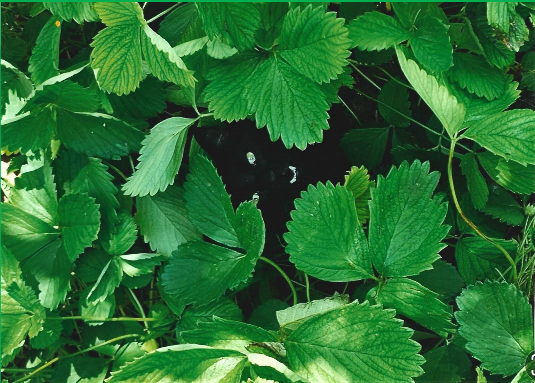
Trudy Healy - Landscape