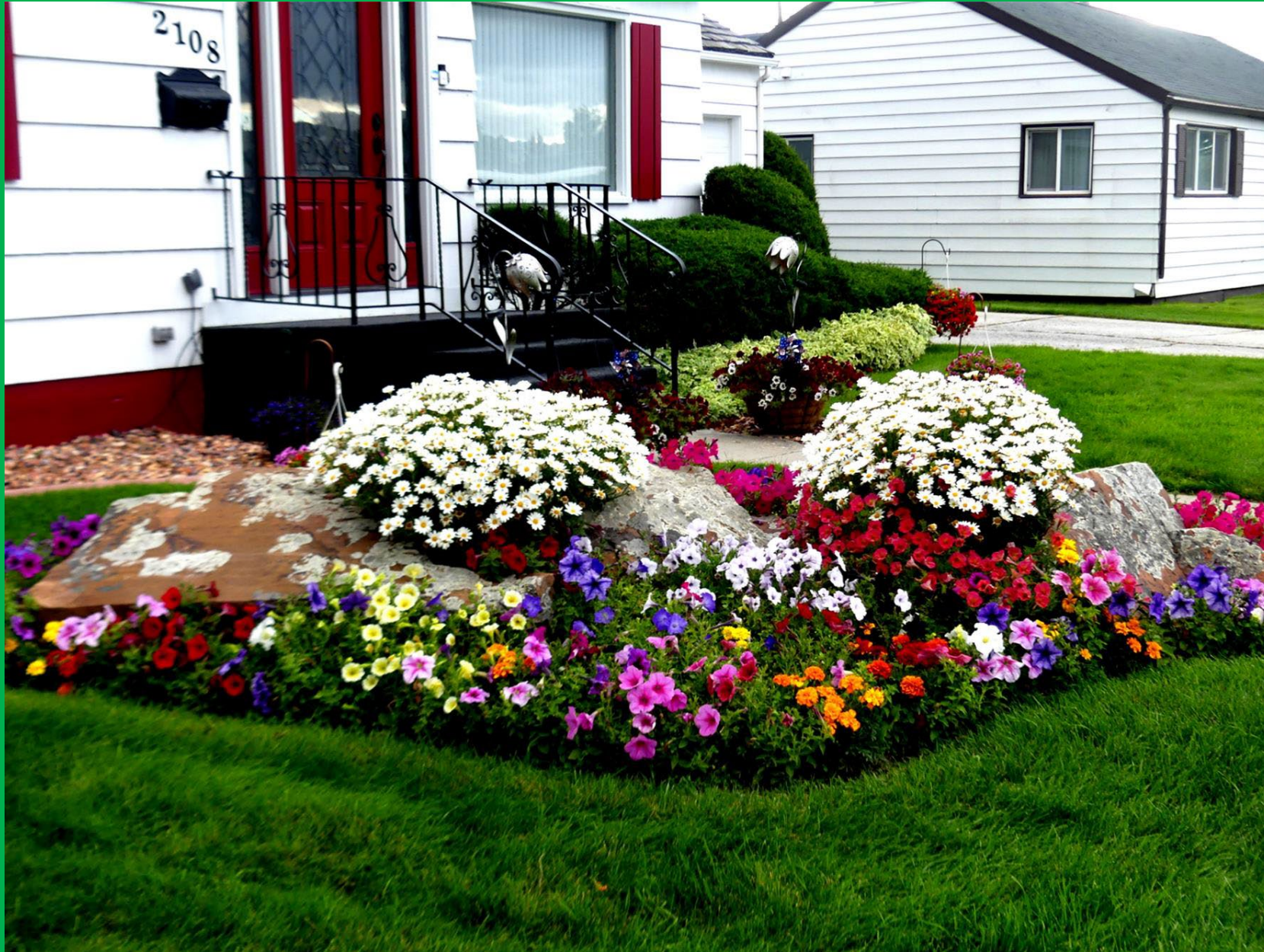
Judy Brogan - Garden of the Week