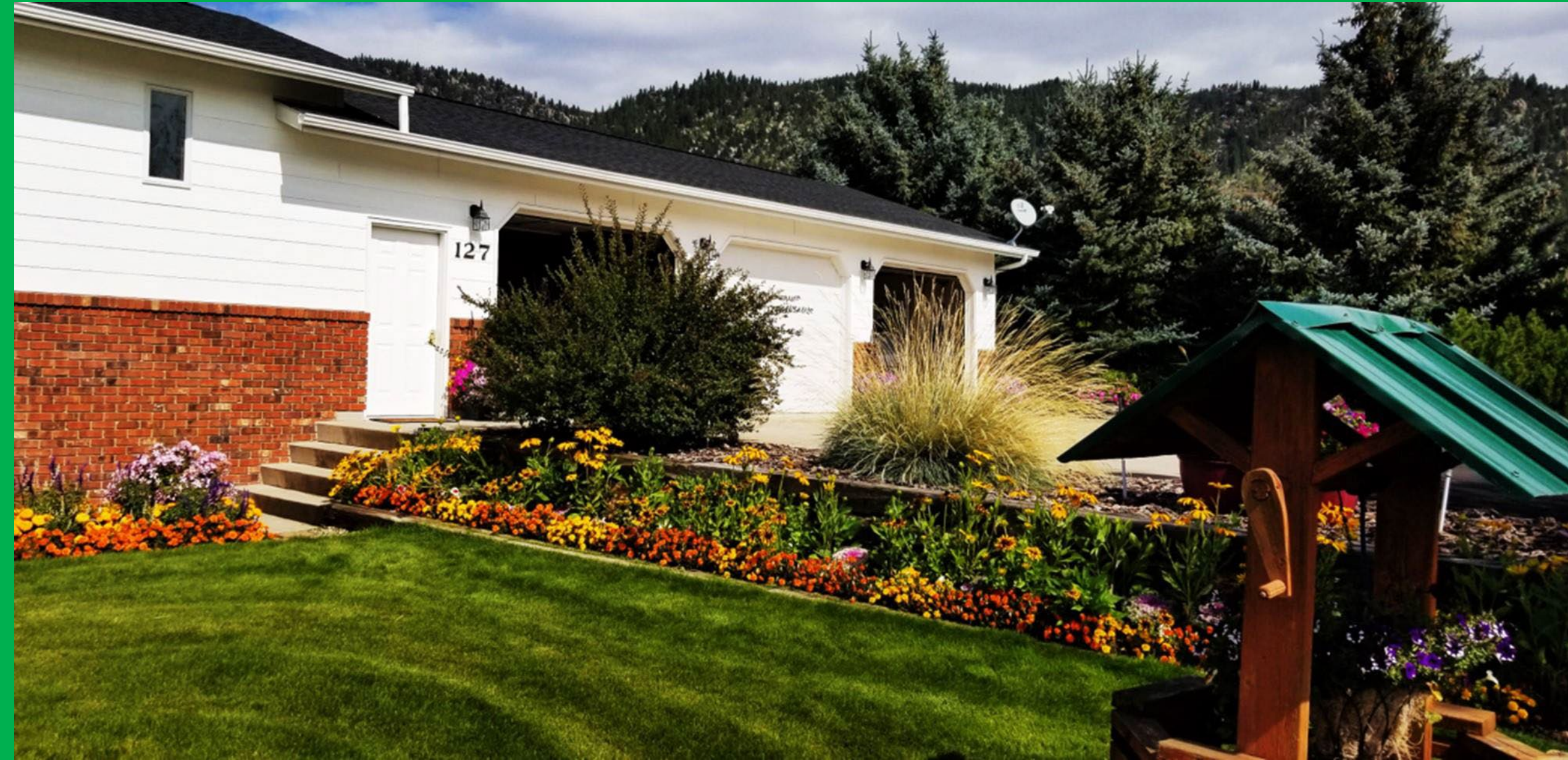
Diana Widhalm - Garden of the Week