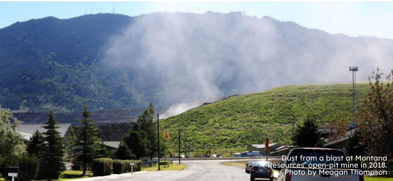
Dust from a blast at Montana Resources' open-pit mine in 2018.

Montana Resources, the operator of the neighboring open-pit mine, currently extracts more than 50,000 tons of ore daily that are hauled, then crushed and milled on-site to produce copper and molybdenum concentrates. This activity creates a fine particulate dust that is carried by the wind and deposited across the Greeley Neighborhood. The particulates are a nuisance and also contain trace metals that are potentially impacting the health, and most certainly decreasing the quality of life and well-being, of Greeley residents.